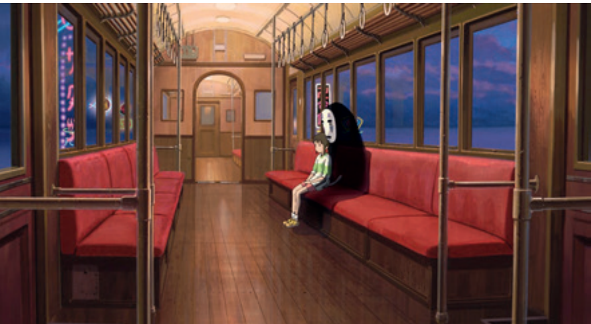
Chihiro and No Face on the train en route to Zeniba's house Spirited Away , Studio Ghibli, 2001, see pages 208–210