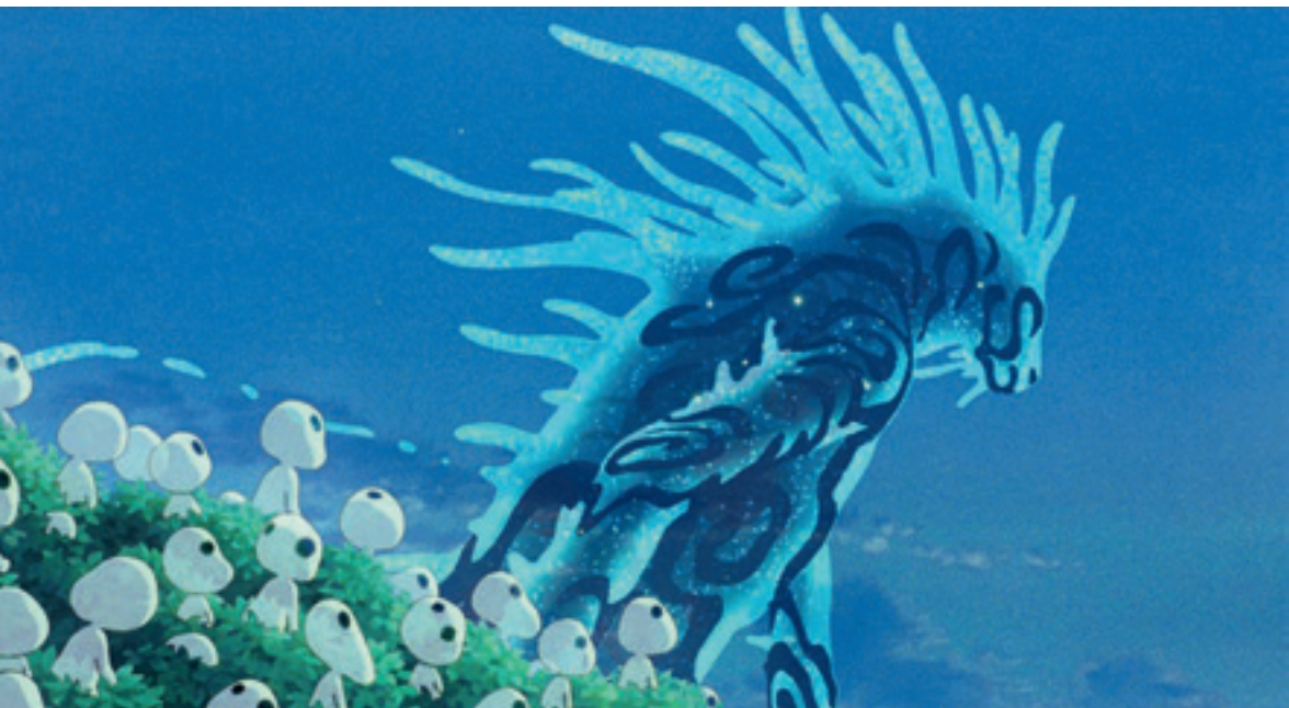
The shishigami walks the mountains followed by kodama. Princess Mononoke , Studio Ghibli, 1997, see pages 186–192