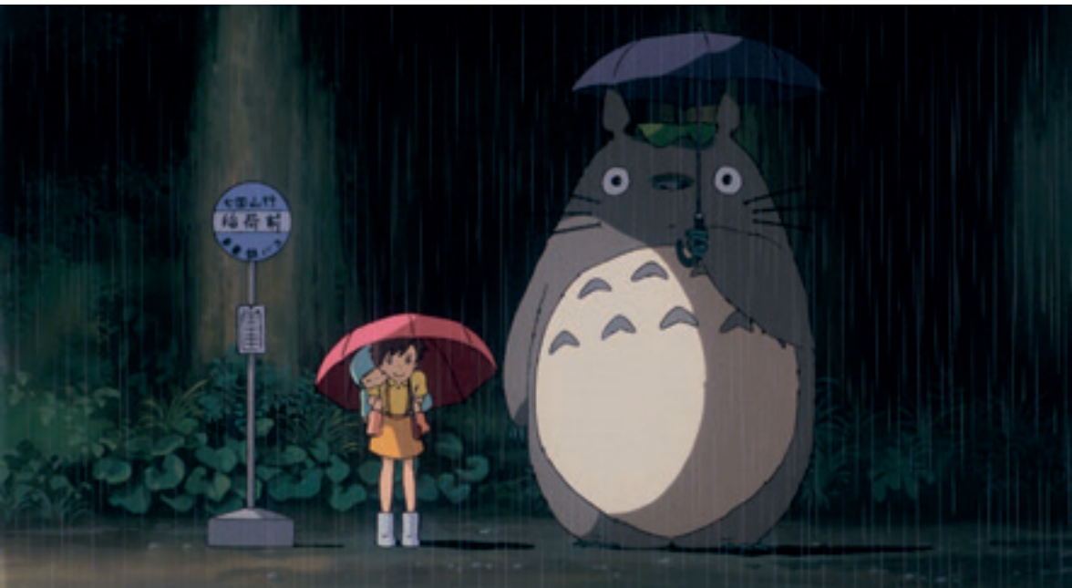
Satsuki, Mei, and Totoro wait in the rain for a bus. My Neighbor Totoro , Studio Ghibli, 1988, see pages 112–114