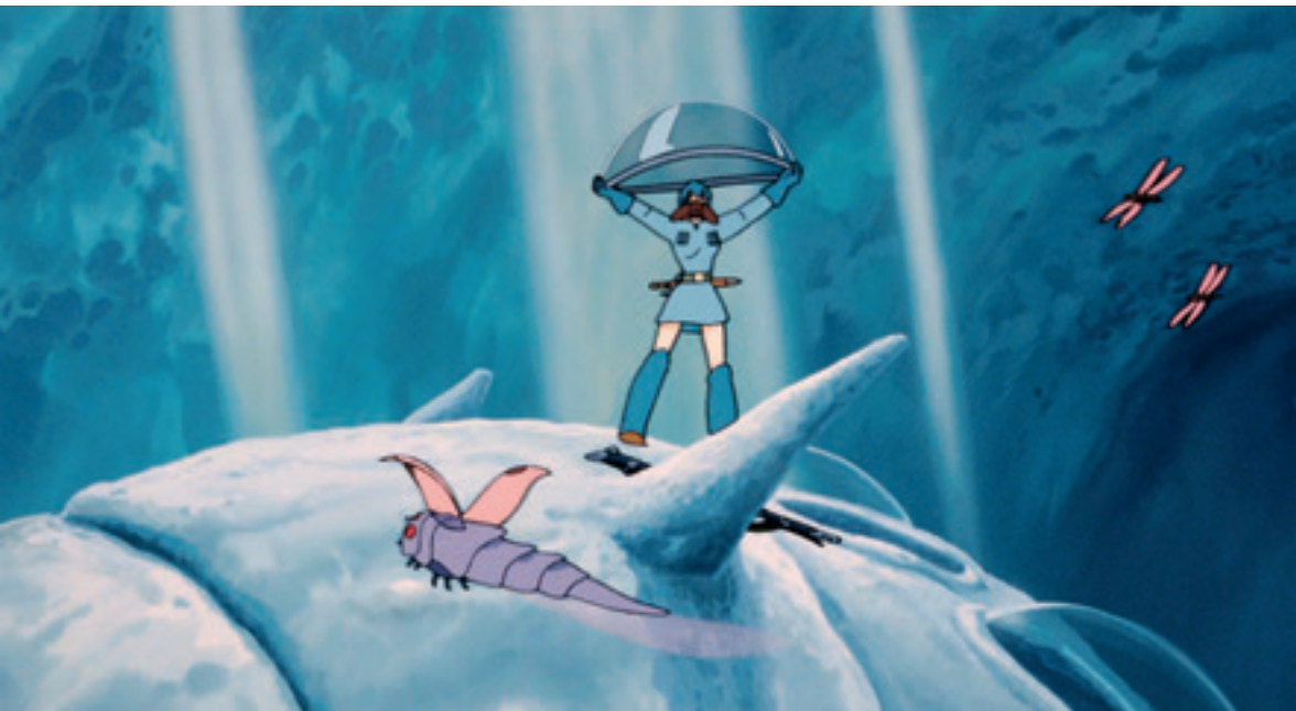
Nausicaä dances with Ohmu eyeshell deep in the Fukai. Nausicaä of the Valley of the Wind , Topcraft Studio, 1984, see pages 73–80