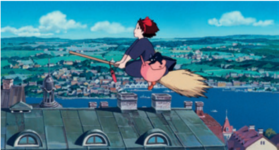
Kiki flies over the beautiful town of Koriko. Kiki's Delivery Service , Studio Ghibli, 1989, see pages 123–130