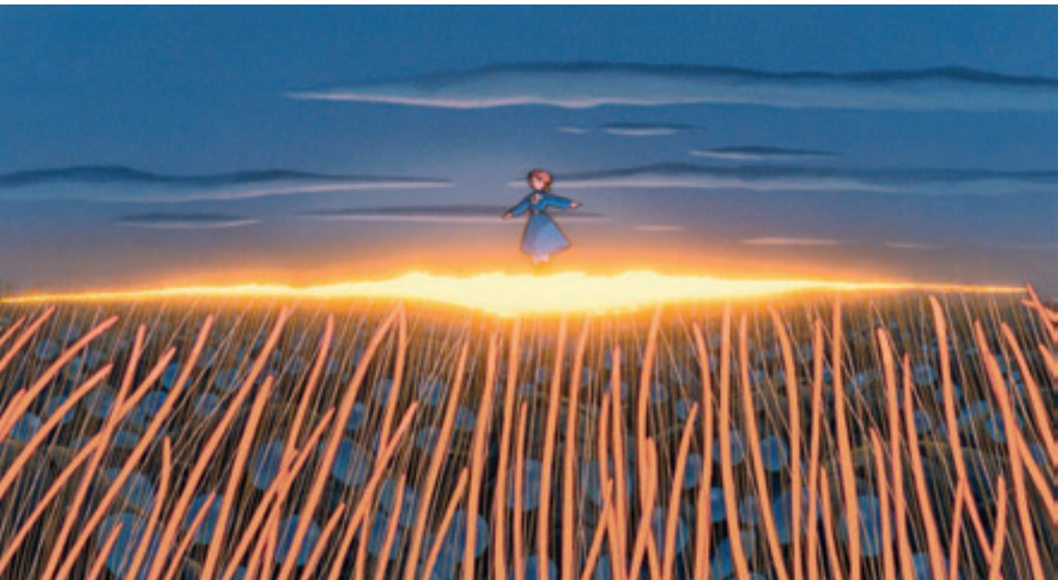
Nausicaä is resurrected on a field of Ohmu feelers. Nausicaä of the Valley of the Wind , Topcraft Studio, 1984, see page 84