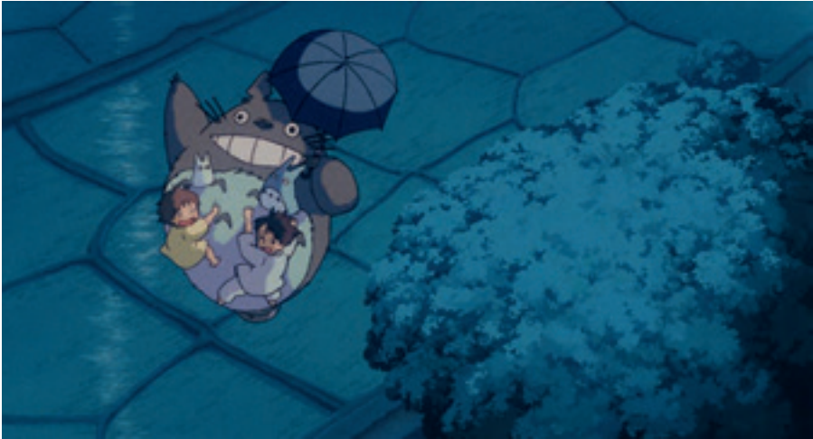
Totoro takes Satsuki, Mei, and the junior totoros on a flight above their rural community. My Neighbor Totoro , Studio Ghibli, 1988, see page 115